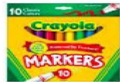
2 packs of 10 Crayola Markers