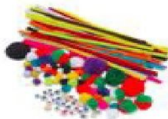
Art Supplies (Googly Eyes, Pom-Poms, Pipe Cleaners, Colored Popsicle Sticks, glitter, buttons, food coloring, brown paper bag, glitter glue)