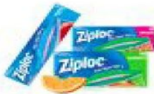
Ziploc Bags (Gallon, Quart, Sandwich, Snack)

The following items are WISH LIST items. If you could help with any of these, we would appreciate it!