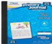
2 Primary Composition Notebooks

Please provide the following supplies to be used at school. Please DO NOT label the supplies.