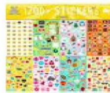
Stickers (large & small)