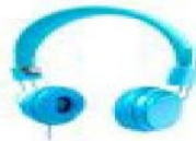
1 pair of headphones (Please put Your child's name on them)