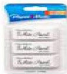
1 pack of white erasers

** This List includes the supplies for both classes. **