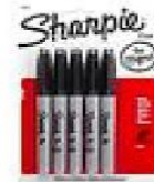
Black Sharpie Markers