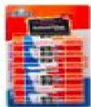
1 pack of glue sticks 1 jumbo